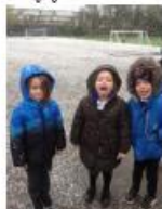
Do you think we caught any snowflakes on our tongues?