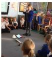
Here we are sorting objects

In Science , we have named everyday materials and sorted them according to their properties- which were bendy? Soft? Absorbent? Waterproof? We also went on a hunt around school and labelled what things were made from. We really enjoyed investigating different materials and experimented to see which material would be best to make a waterproof cape out of for Little Red Riding Hood.