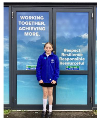
Ostrich Class Reindeer