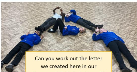
Can you work out the letter we created here in our 'human alphabet challenge'?

In maths, we have been working hard on arithmetic practice daily as well as our maths units of fractions, decimals and percentages, measure: perimeter and area and graphs & tables.